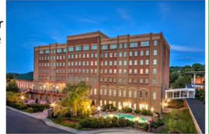
Carnegie Hotel & Spa

What would it mean to your Xooma business if you were able to share Xooma's products, especially X2O, with more passion, conviction – along with a certification? NOW is your chance!