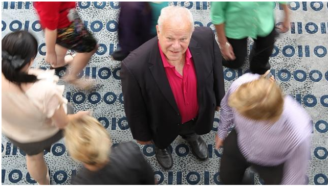
Dr. Martin Seligman

Positive Psychology really launched in 1998 after Dr. Martin Seligman (President of the American Psychological Association) gave his Presidential address. He coined the term in his speech that was entitled, “Building Human Strength: Psychology’s Forgotten Mission.” Since then, the APA has declared Dr. Seligman as the father of Positive Psychology.